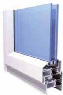
General use applications

The series features solutions designed to meet the exacting requirements of Document L 2010.